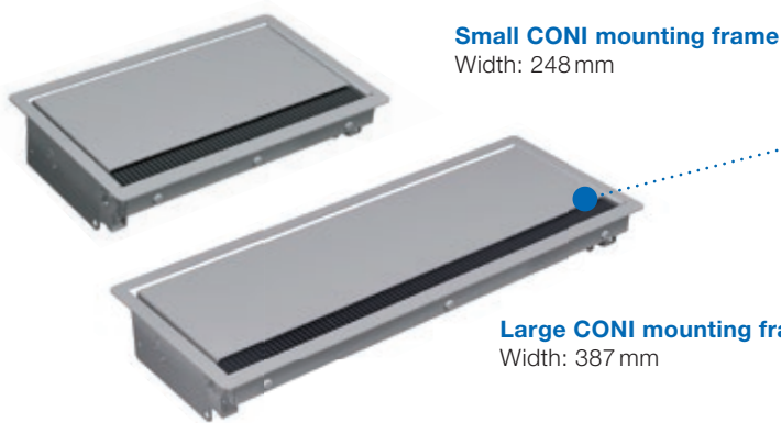
Small CONI mounting frame Width: 248mm