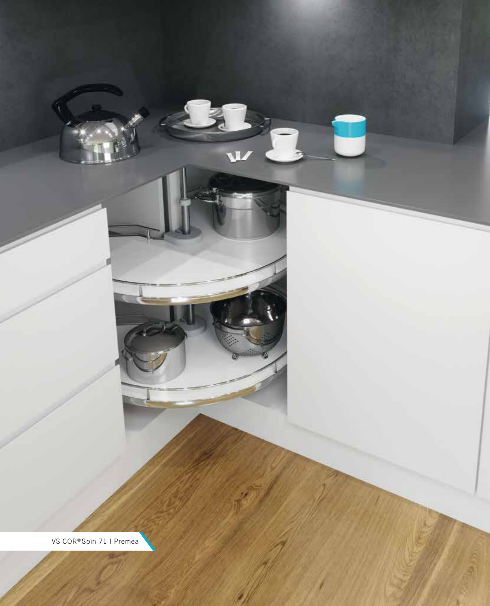
VS COR® Spin 71 | Premea